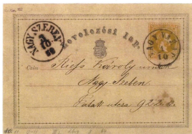
Figure 2: First-day usage of the first official postal correspondence card of the world on 1 October 1869